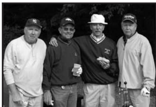
Secaucus foursome keep up their strength.