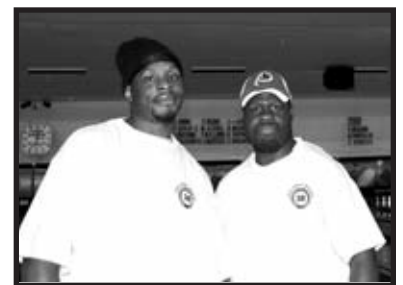
Orange Letter Carriers showed their support for MDA.