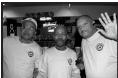
East Orange Letter Carriers came out strong for Jerry's Kids.