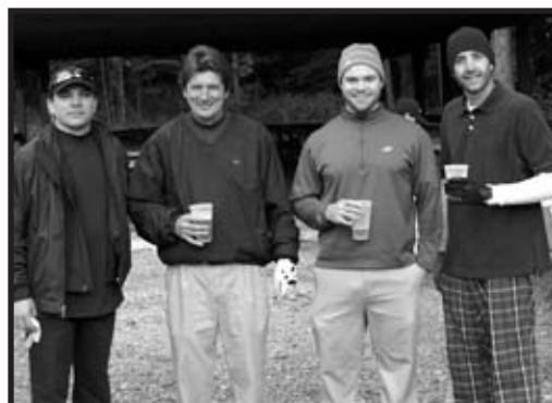
Clifton Carriers on a "coffee break."