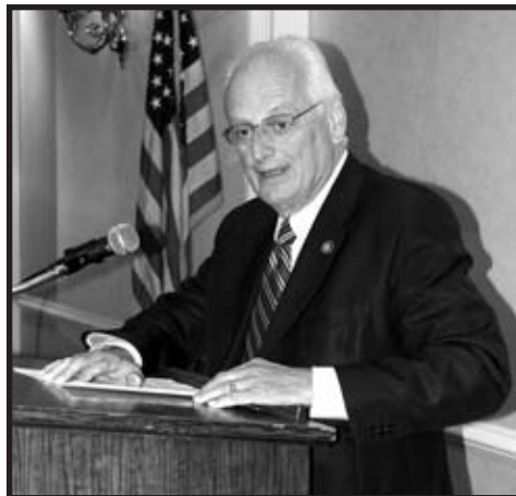
Congressman Bill Pascrell pledges his continued support.