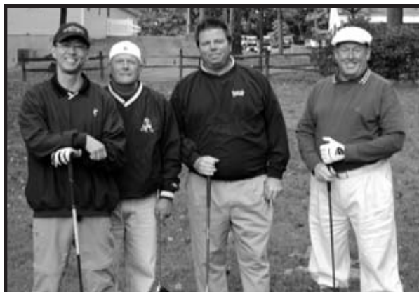
East Brunswick Carriers came ready to play.